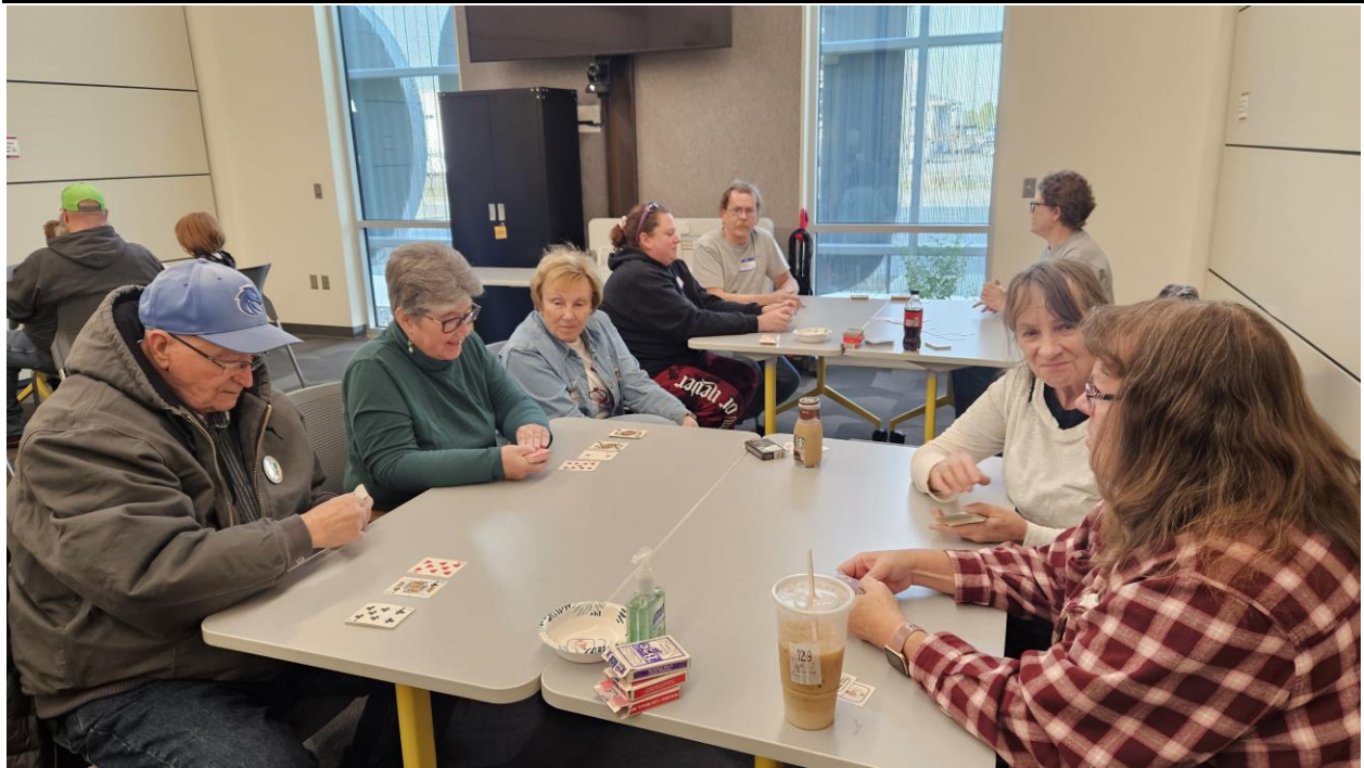
GCBCTW8 IE WSGA Table Game Day! Come PLAY With Us! Spokane