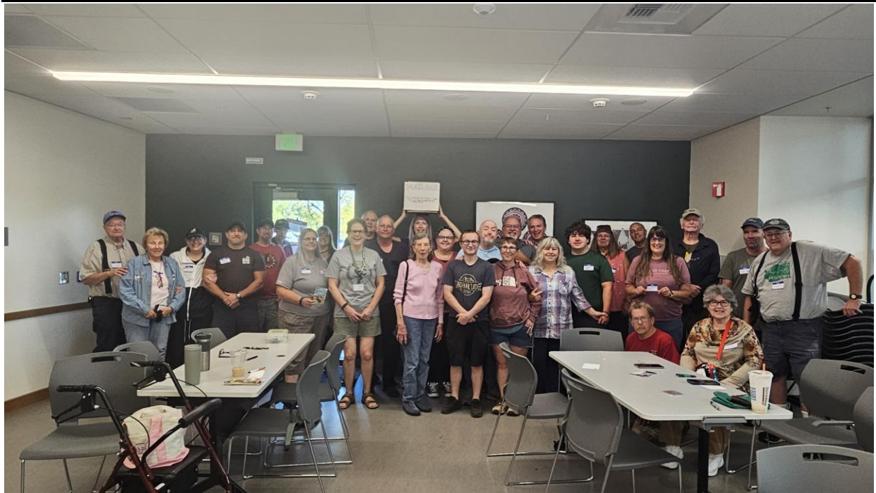
GCBB6FQ WSGA IE Chapter WORLD POSTCARD DAY EVENT!