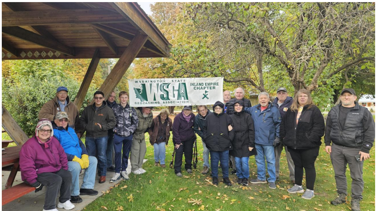
GCBCZK5 A Funny Thing Happened on the Way to the Geocache!